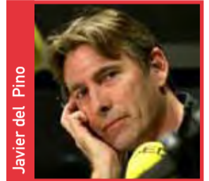
Javier del Pino